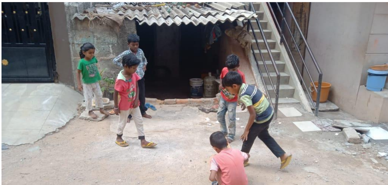
During Covid 19...