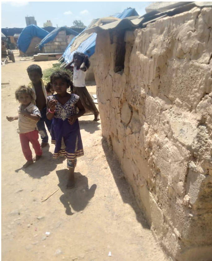
Students in slum during school hours